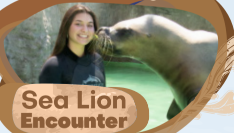
Sea Lion Encounter

Aquarium is Dolphin Discovery's first acquisition in South America. This Park is characterized by its natural environment with sea view. Here you can see a great diversity of animals, among Birds, Marine Mammals, Fish and Sharks. Here are the interactions you can enjoy at this emblematic Park in Argentina.