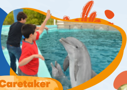
Caretaker for a Day