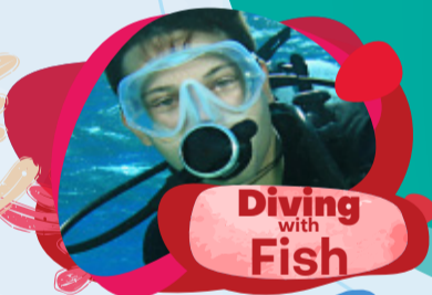
Diving with Fish